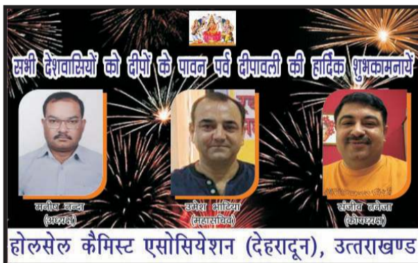
होलसेल कैमिस्ट एसोसियेशन (देहरादून), उत्तराखण्ड