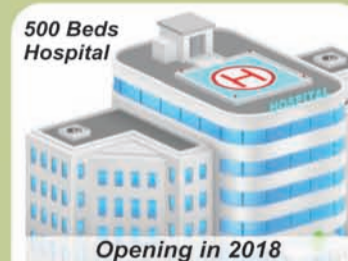
Sec. 01, Noida Extension