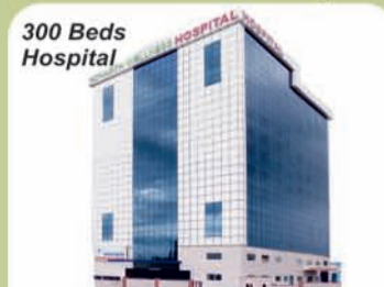
Sec. 110, Noida