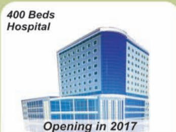
HO-01, Greater Noida