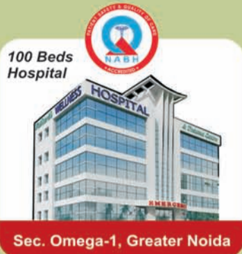
Sec. Omega-1, Greater Noida